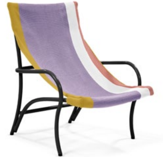
gold/purple/red/ black 01AHLC-D