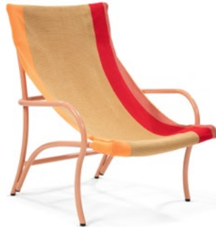
orange/gold/red/ pink sand 01AHLC-C