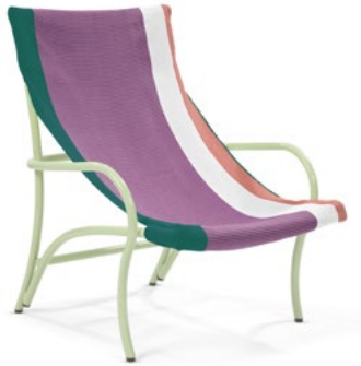
turquoise green/purple/red/ pastel green 01AHLC-A