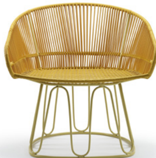
honey yellow/yellow 00ACILC-B