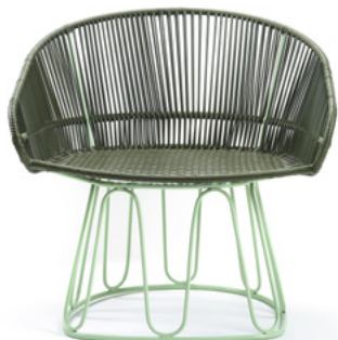
olive green/pastel green 00ACILC-A