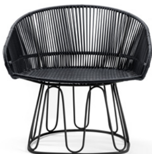
matt black/black 00ACILC-D