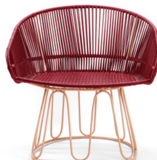
red/pink sand 00ACILC-C