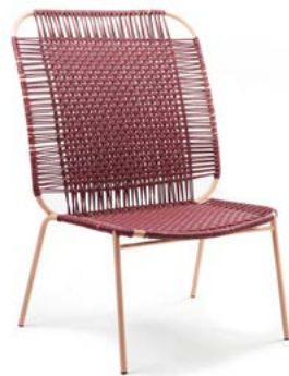
red/pink sand 00ACLC2-5