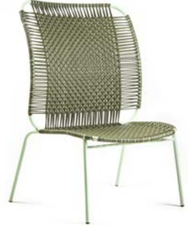
olive green/pastel green 00ACLC2-4