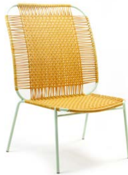
honey yellow/pastel green 00ACLC2-6