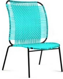
light green/black 00ACLC2-2