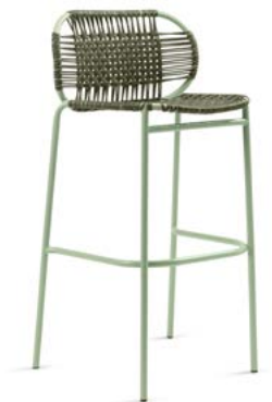
olive green/pastel green 00ACBS-4