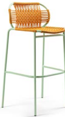
honey yellow/pastel green 00ACBS-6