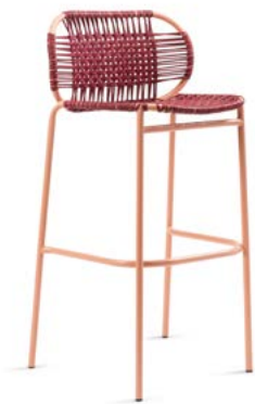
red/pink sand 00ACBS-5