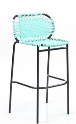
light green/black 00ACBS-2