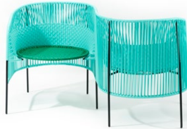
turquoise/ emerald green/black 01ACAVAV-C