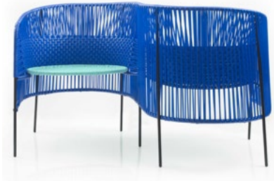
signal blue/ turquoise/black 01ACAVAV-B