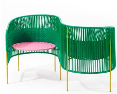
emerald green/ bubblegum rose/curry yellow 01ACAVAV-F