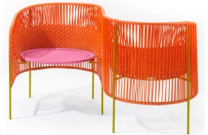
orange/ bubblegum rose/curry yellow 01ACAVAV-E