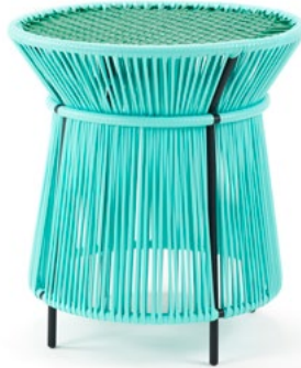
turquoise/ emerald green/black 01ACAHT-C