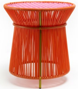
orange/ bubblegum rose/curry yellow 01ACAHT-E