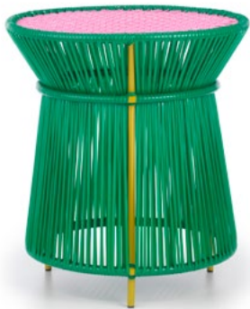
emerald green/ bubblegum rose/curry yellow 01ACAHT-F