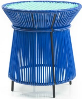
signal blue/ turquoise/black 01ACAHT-B