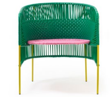
emerald green/ bubblegum rose/curry yellow 01ACALC-F