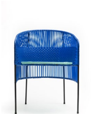
signal blue/ turquoise/black 01ACALC-B