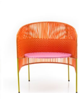
orange/ bubblegum rose/curry yellow 01ACALC-E