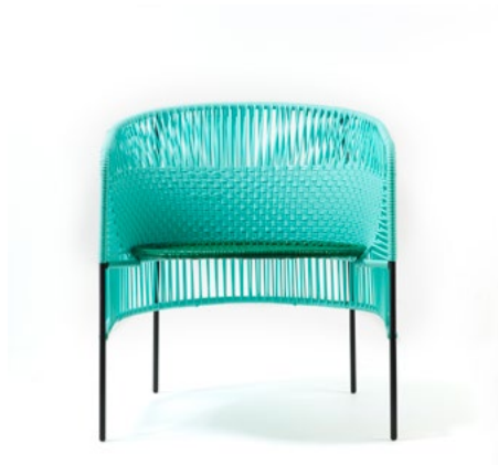
turquoise/ emerald green/black 01ACALC-C