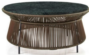
verde guatemala/terra/black 01ACAML-C