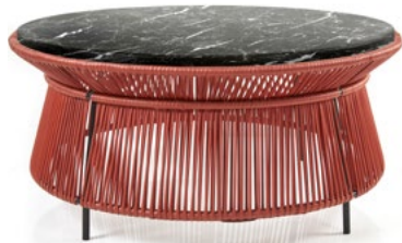
nero marquinia unito/copper/black 01ACAML-B