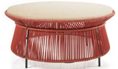
crema nuova/copper/black 01ACAML-D