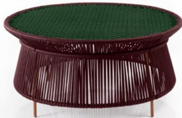
black red/moss green/copper 01ACALT-Q