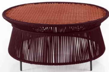
black red/copper/black 01ACALT-N