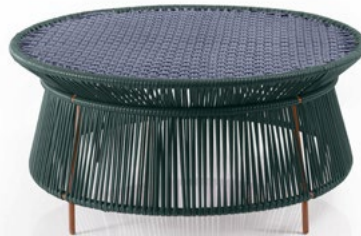
moss green/dark blue/copper 01ACALT-R