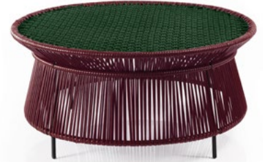
black red/moss green/black 01ACALT-M