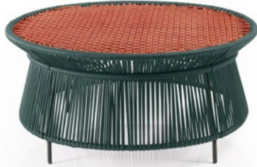
moss green/copper/black 01ACALT-I