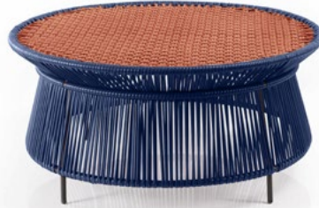
dark blue/copper/black 01ACALT-J