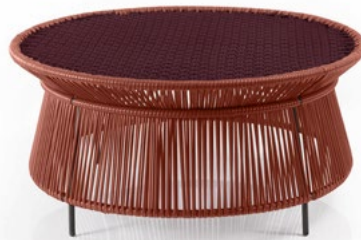
copper/black red/black 01ACALT-O