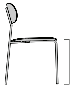
HEIGHT OF THE SEAT